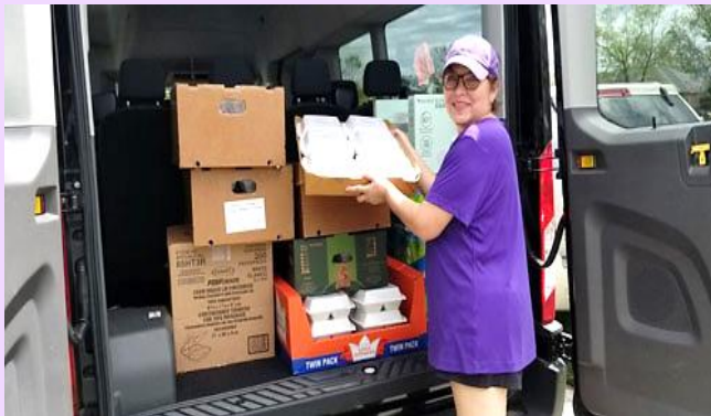
Our Forged by Fire team serving the community of Houma and the saints of Grace Lutheran following Hurricane Ida

This grant will allow the purchase of a mobile, self-contained kitchen trailer unit to provide meals in communities affected by disaster. Over 130,000 meals have been served in the Gulf Coast region. The mobile kitchen will benefit smaller communities in need that are often overlooked by larger organizations. When serving, Forged by Fire Services strives to connect local LCMS congregations within the communities and share the mercy and grace of Christ, one plate of food at a time.